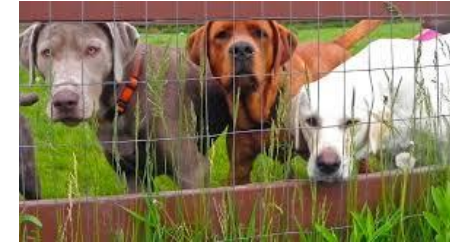
Fencing dogs in