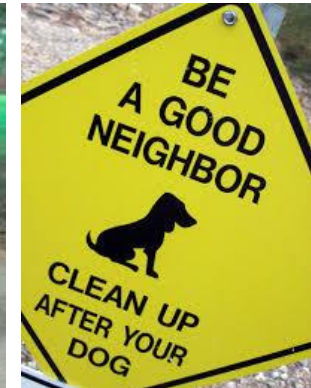
Keep the environment poop free