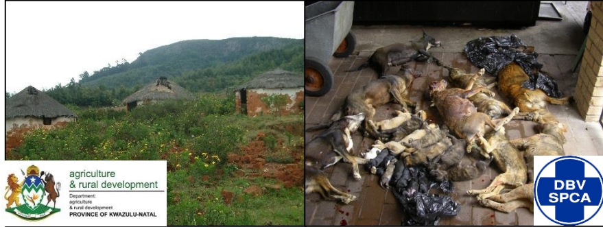
KZN Rabies 2007-2016