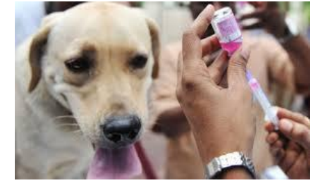
Vaccinate your dog (Rabies etc)