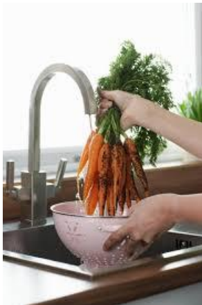
Wash vegetables from gardens